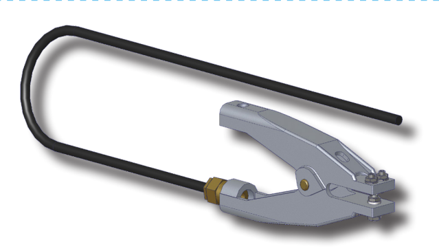
EAC201: Earth Assurance Clamp.

The EAC200 series earth assurance clamp is used to discharge the static accumulation of hazardous products during storage and transportation.